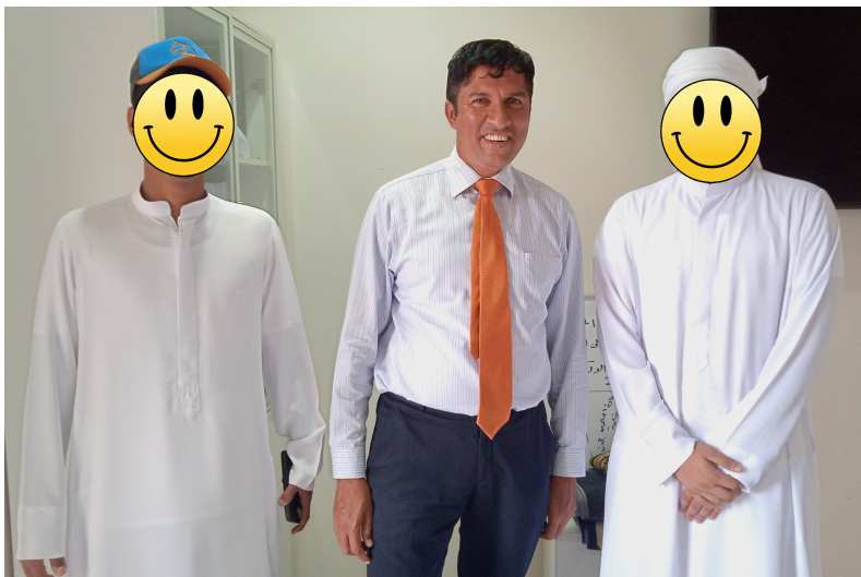
Training Arab Nationals for Professional Development Courses